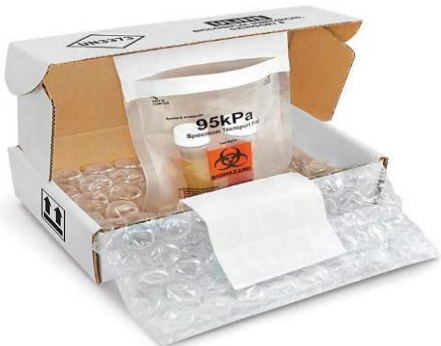
Sample Box from uline.ca Item # to S-18284 (Kits/5)