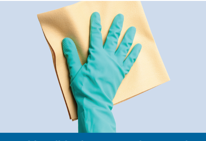
Sanitize all food contact surfaces, cutting boards and tables with sanitizing solution