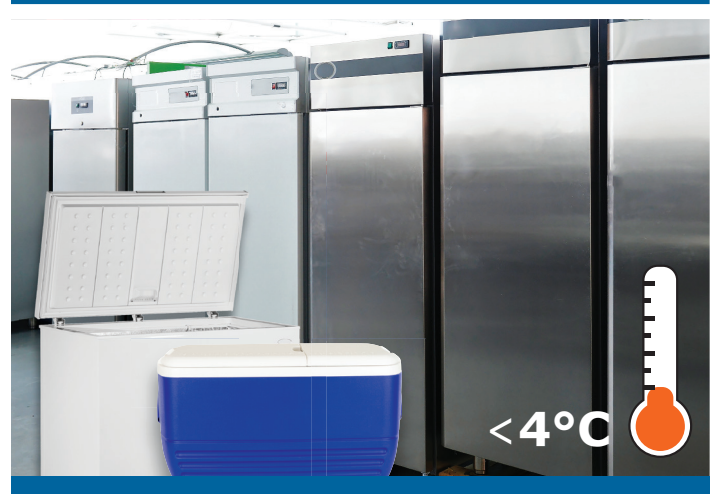
Keep cold food below 4°C with mechanical units or insulated containers with ice