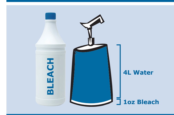
Have a sanitizing solution by mixing 1oz of bleach with 4L of water