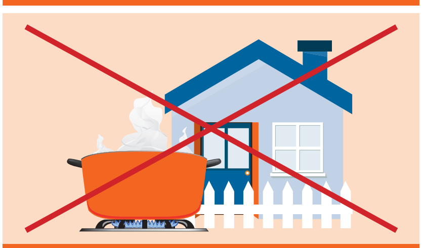
Food must be made in an approved food premises