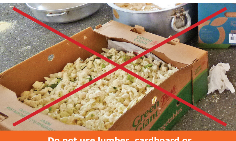
Do not use lumber, cardboard or newspaper to store or handle food