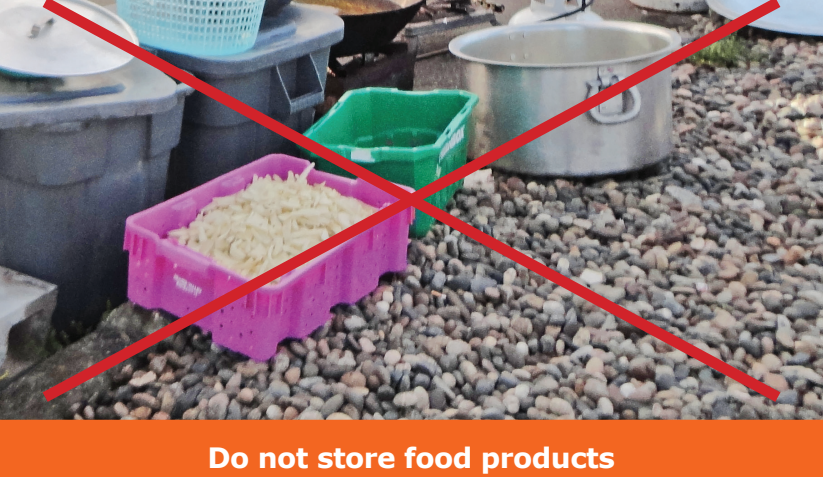
on the ground, grass or gravel