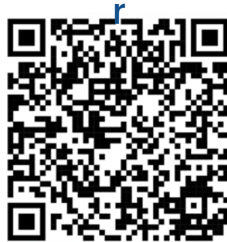
Social Prescribing Poster