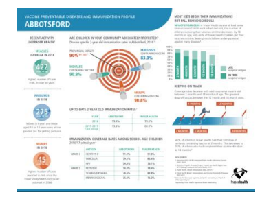
Fraser Health 2 Year-Old Immunization Rates 2016/17 Fiscal Year

www.fraserhealth.ca/health-info/healthtopics/immunizations/surveillance/surveillance