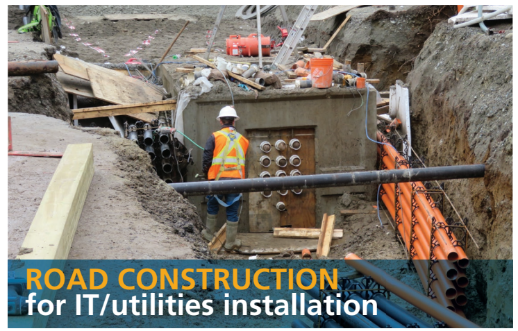
ROAD CONSTRUCTION for IT/utilities installation

“I can see the mental health construction site from my desk and love watching the progress,” ends Tom. “It’s a sign of big things to come for this hospital, this community, and our province.”