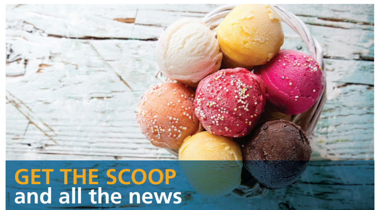
GET THE SCOOP and all the news

We expect road construction to finish in spring 2019.