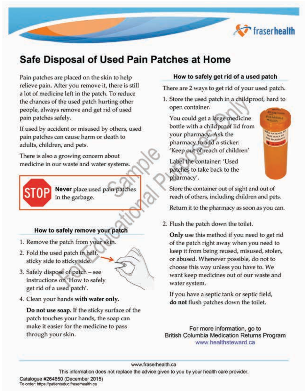
FIGURE A1 – Fraser Health Patient Education Brochure – Safe Disposal of Used Pain Patches at Home