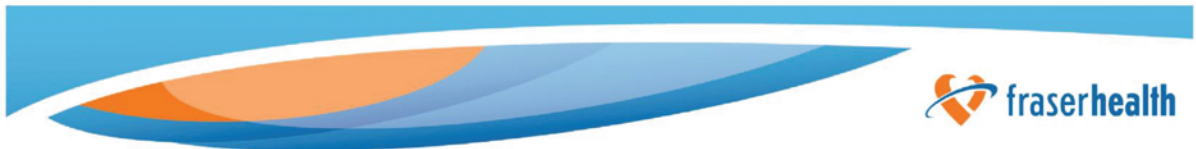
FIGURE A1 – Fraser Health Patient Education Brochure – Safe Disposal of Used Pain Patches at Home