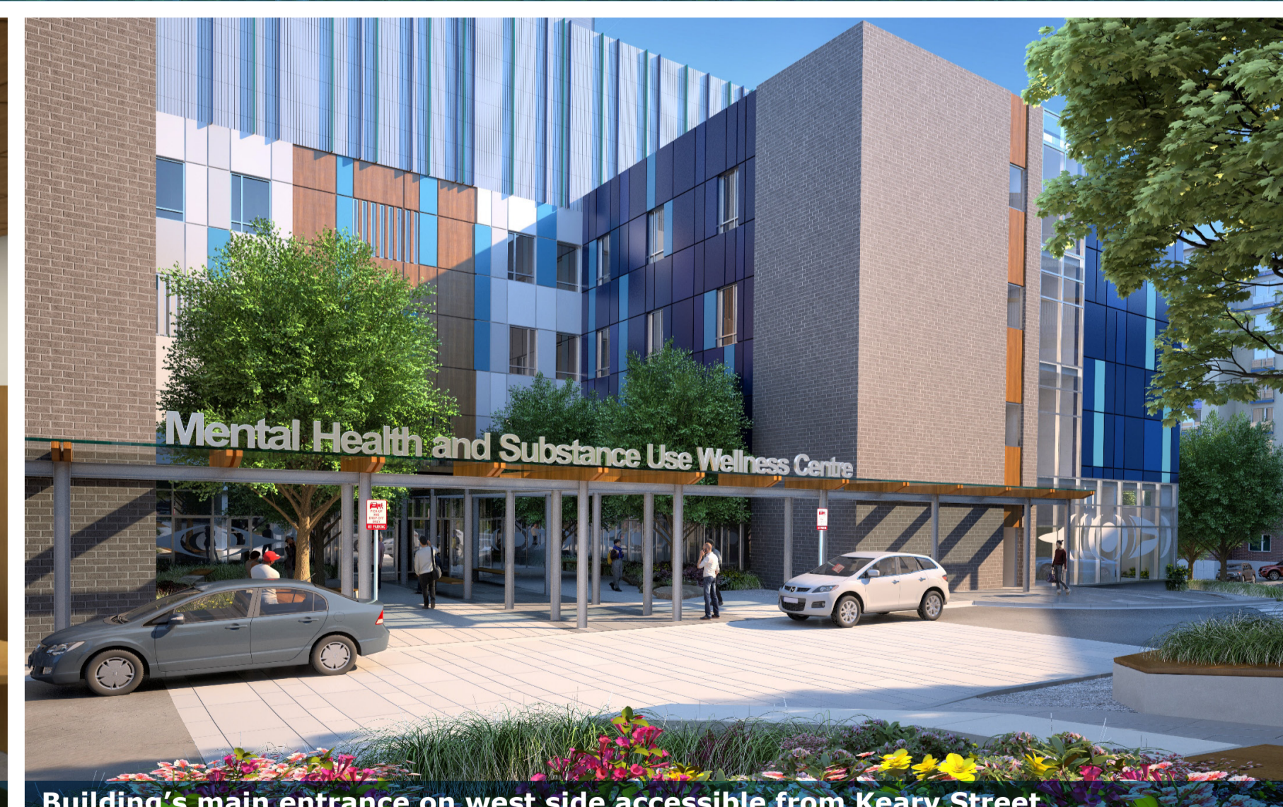
Building's main entrance on west side accessible from Keary Street