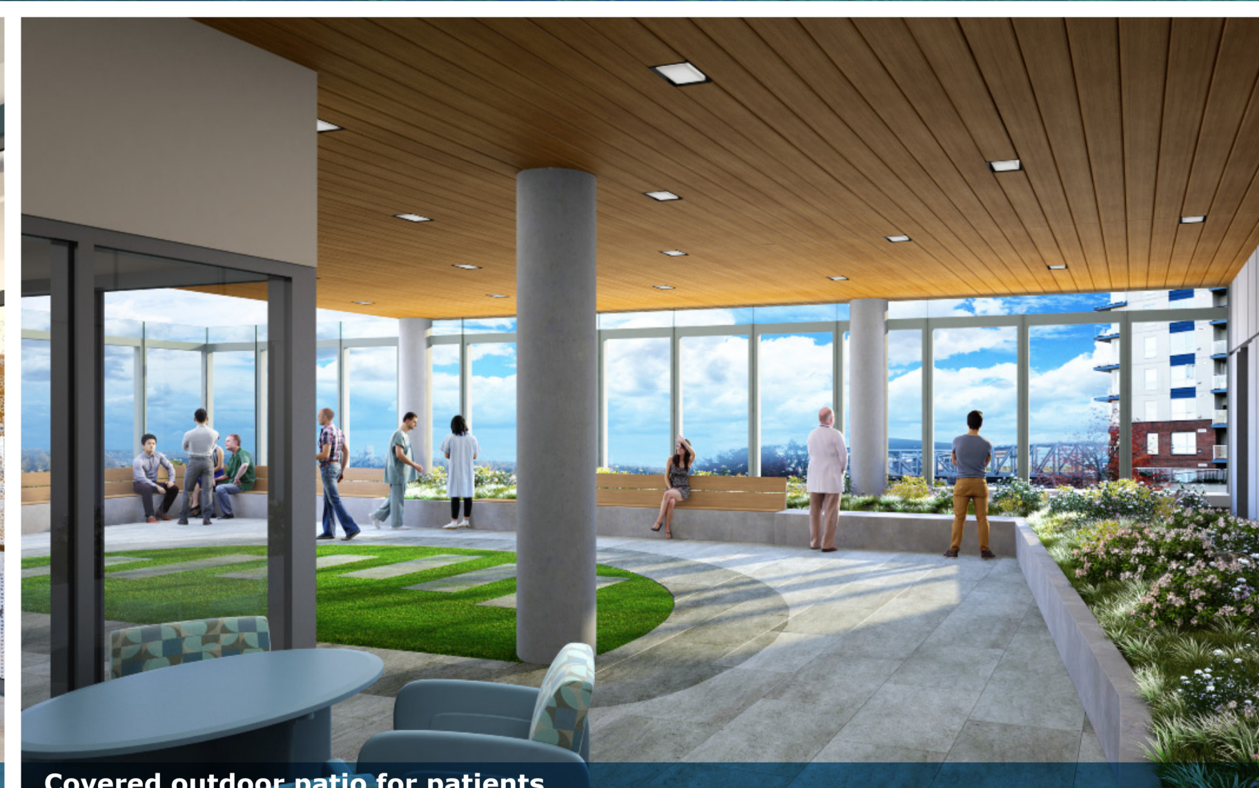
Covered outdoor patio for patients