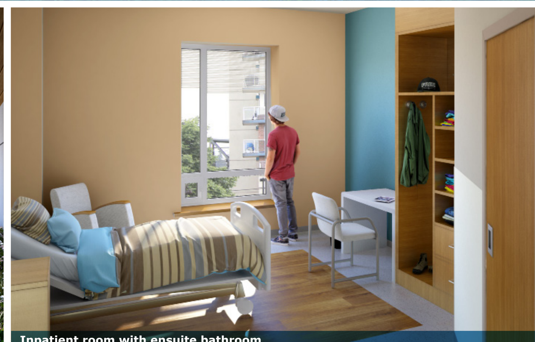
Inpatient room with ensuite bathroom