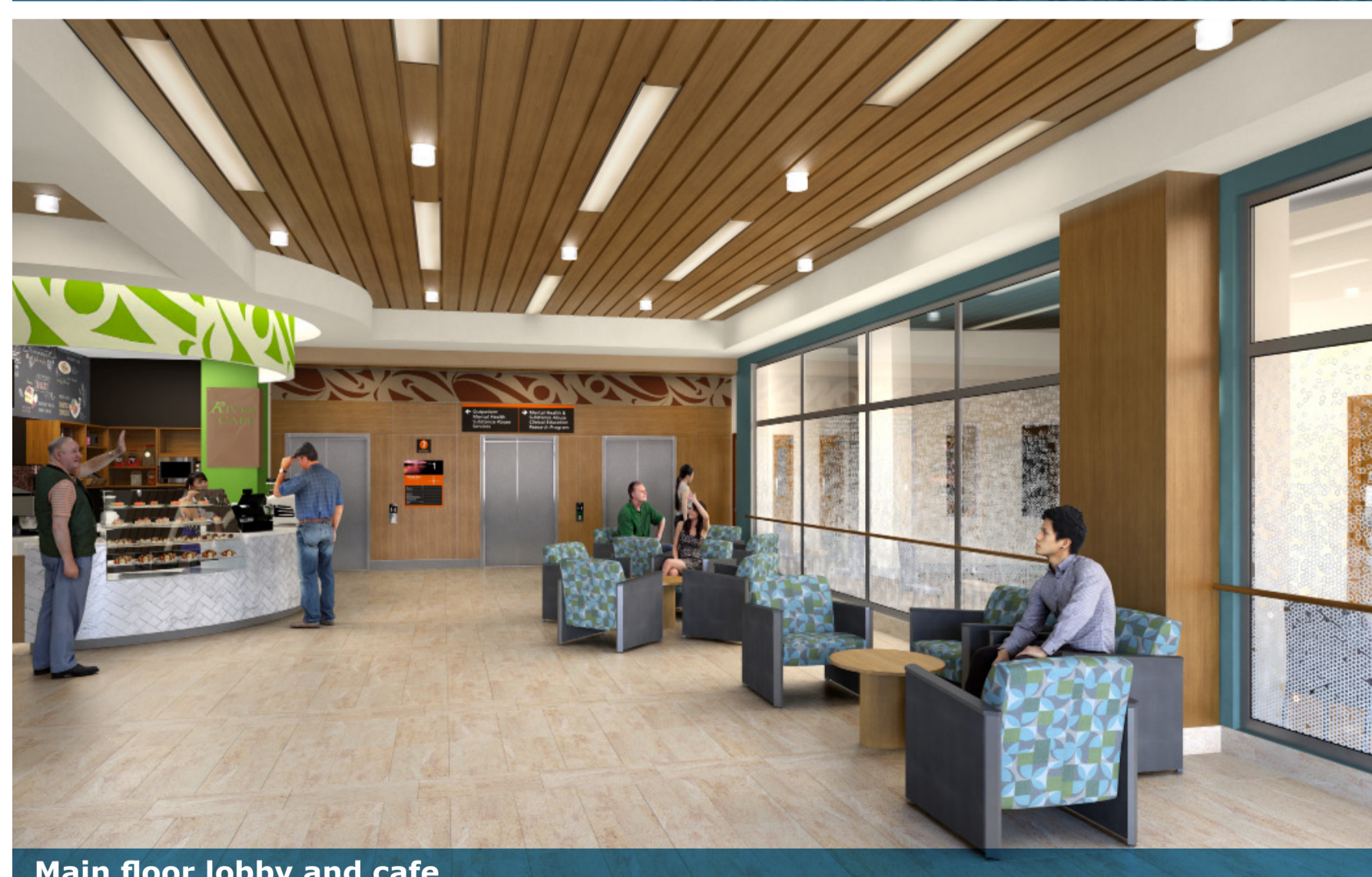
Main floor lobby and cafe