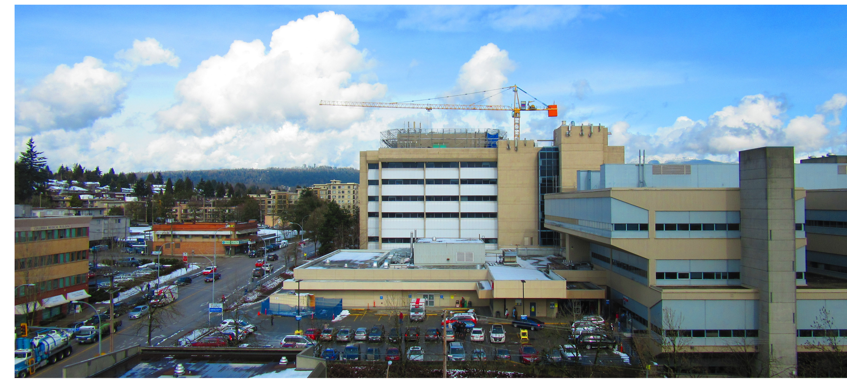
Construction is underway on Columbia Tower's heliport. Helicopters will start landing on it in September 2017 using the new approach and take-off paths.