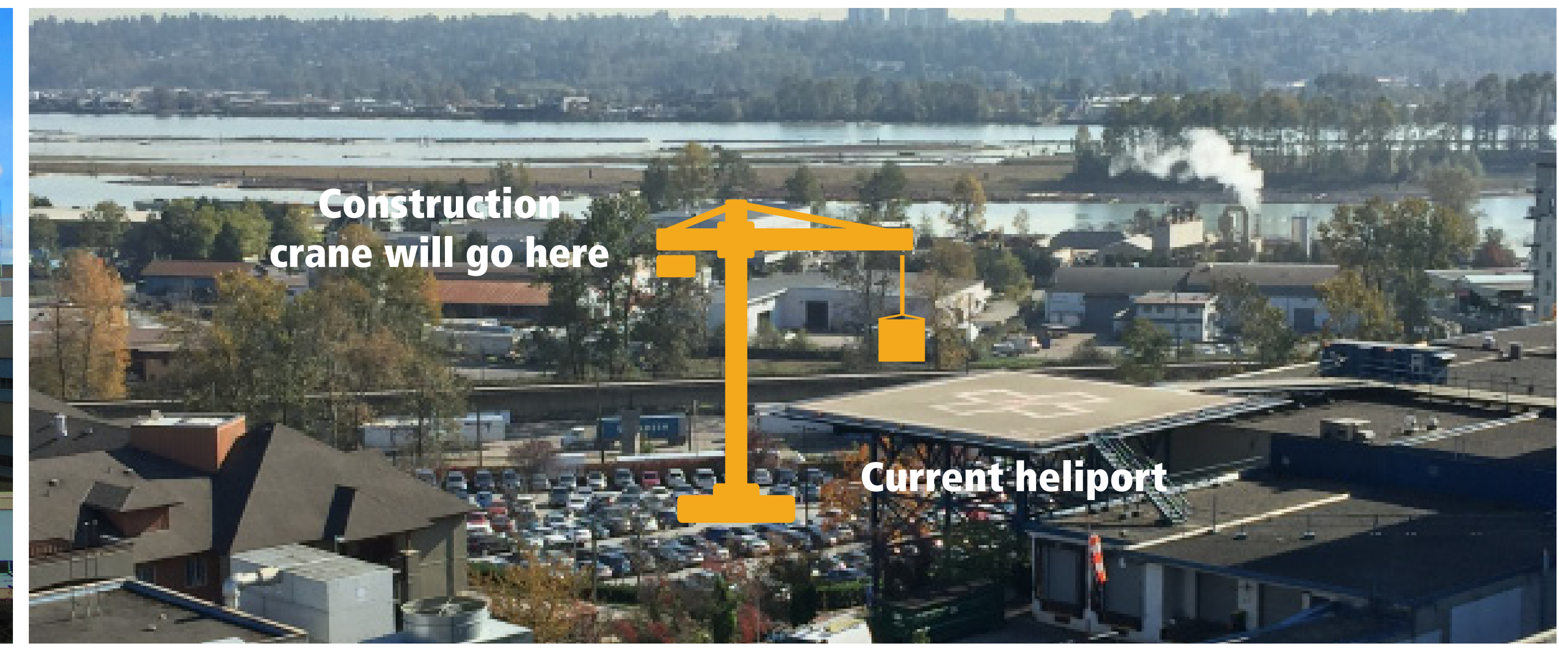
Our existing heliport is too close to construction cranes that will be used to build Phase One and Phase Two. It will be closed at the end of Summer 2017 and later removed.