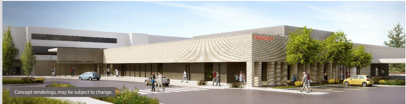
Concept renderings, may be subject to change.