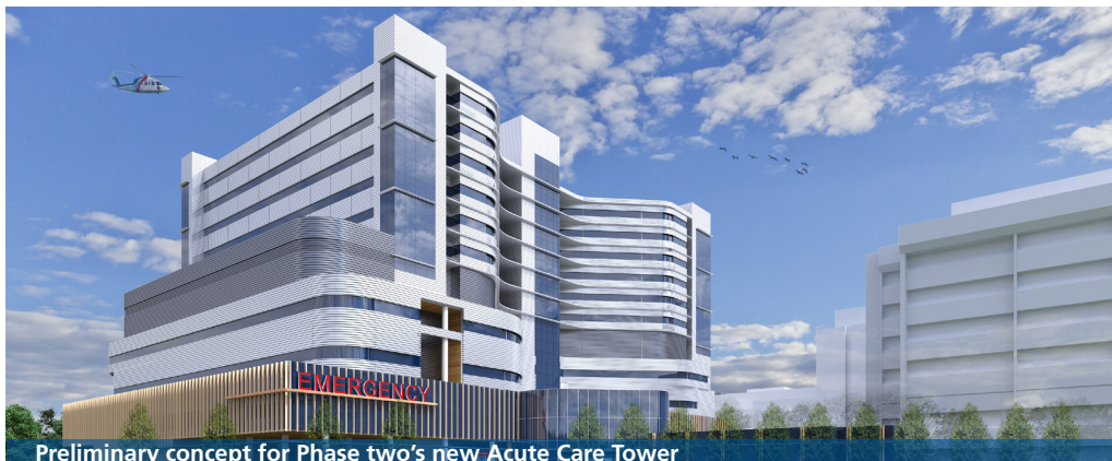
Preliminary concept for Phase two's new Acute Care Tower